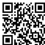
Disinfectants Fact Sheet Western States PEHSU