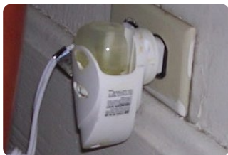
Candles and air fresheners