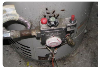
Pests and pesticides