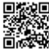
Frequently Asked Questions