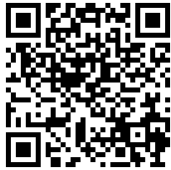
QR code for mobile access

Antibiotic duration for amoxicillin, amoxicillin/clavulanate, cefuroxime, cefdinir, cefpodoxime, cefprozil, and clindamycin: • <2 years of age OR severe AOM OR chronic AOM OR recurrent AOM OR TM perforation = 10 days • 2-5 years of age with non-severe symptoms = 7 days • ≥6 years of age with non-severe symptoms = 5-7 days