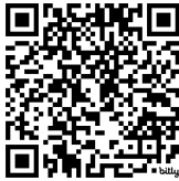
QR code for mobile view

Abbreviations (laboratory & radiology excluded): pt. = patient