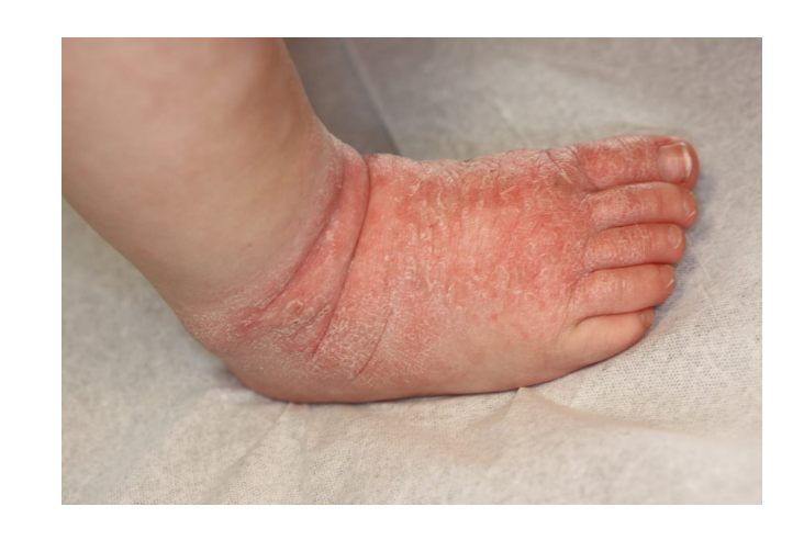
Localized moderate eczematous plaque with lichenification