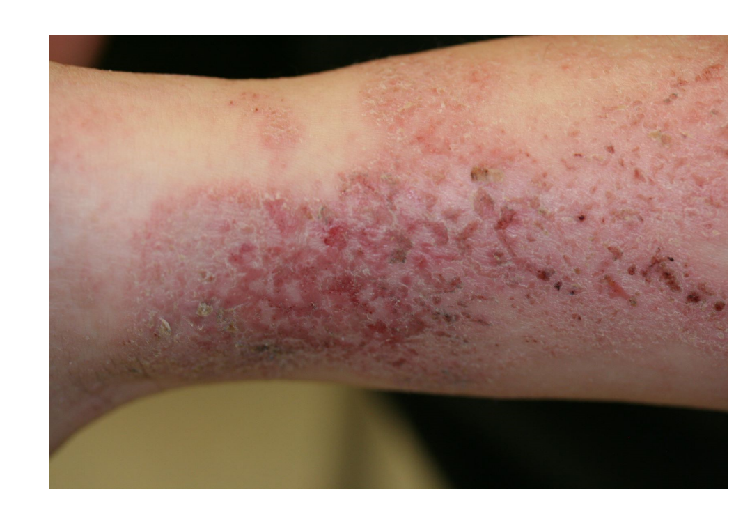
Moderate eczematous plaques with excoriations