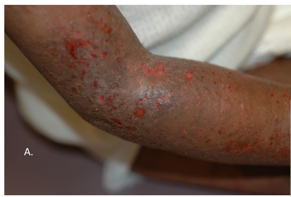
A. Diffuse eczematous plaques with extensive erosions Possible secondary infection