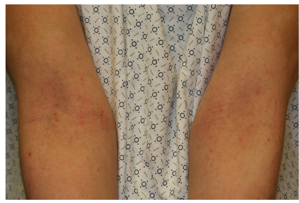
Localized mild-moderate eczematous plaques with lichenification and excoriations