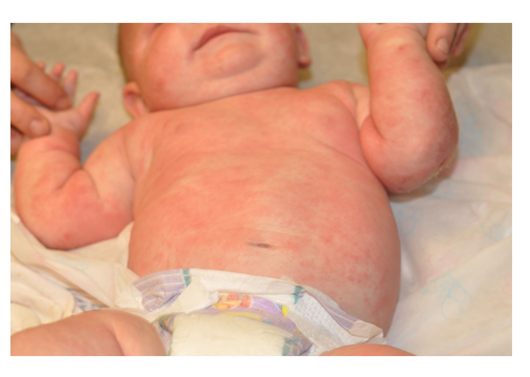
Diffuse mild-moderate eczematous plaques