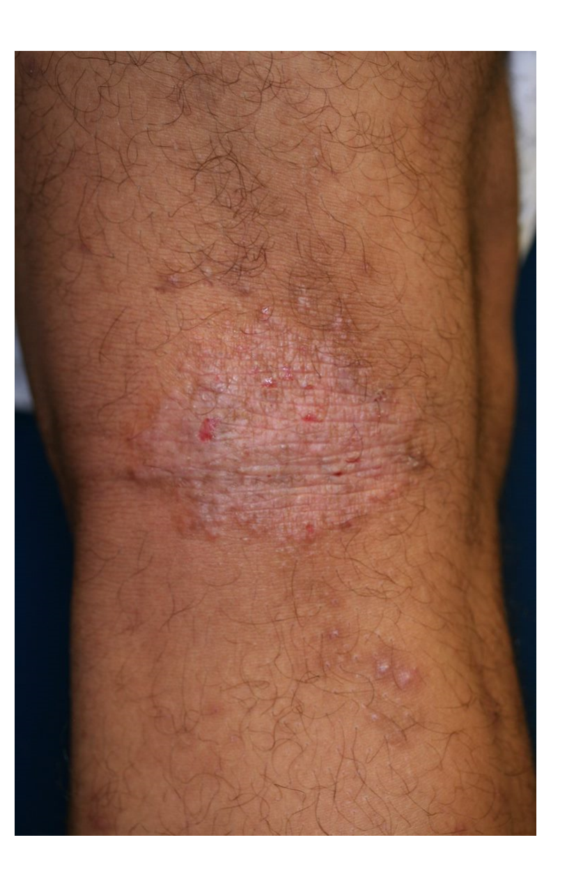
Localized lichenified eczematous plaques