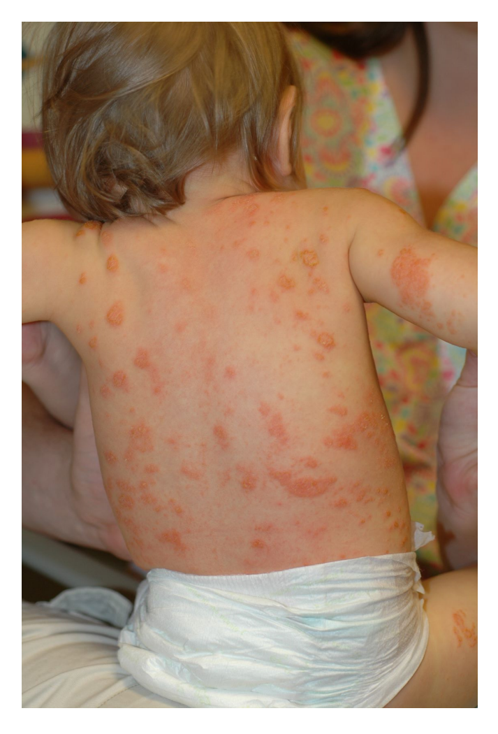
Widespread nummular eczematous plaques