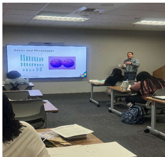
STAR 2.0 Classroom